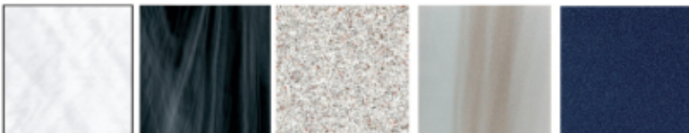
sterling silver pearl shadow moonscape desert horizon cobalt